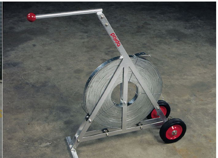
Strap Brace Dispenser