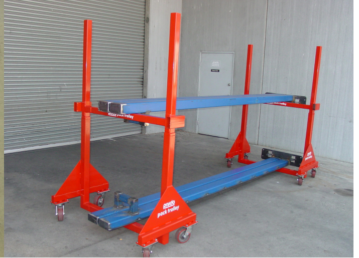
Two Pack trolley